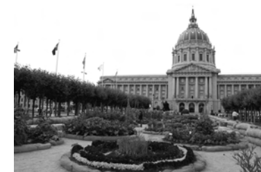
Civic Center's Victory Garden receives Klussmann grant.

Slow Food Nation/Civic Center Plaza Victory Garden, $5,000 to build the pathways making this Victory Garden ADA-compliant.