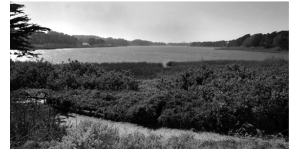
Lake Merced receives the 2008 Friedel Klussmann Award.