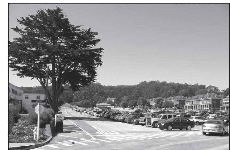
This car-filled parking lot will someday become a landscaped open space once plans for the greening of the Presidio Main Parade Ground are approved.

San Francisco Beautiful continues to work for the beautification and upgrade of the Presidio's Main Post district and will be reviewing and commenting on the SEIS as it moves forward.