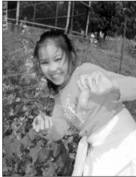
A Lakeshore student proudly displays her harvest.

The SFPUC and Daly City will be continuing their wetlands treatment pilot project this winter. The goal is to evaluate the feasibility of using Daly City stormwater runoff to increase source water to Lake Merced to increase the water level and alleviate flooding near the South Lake.