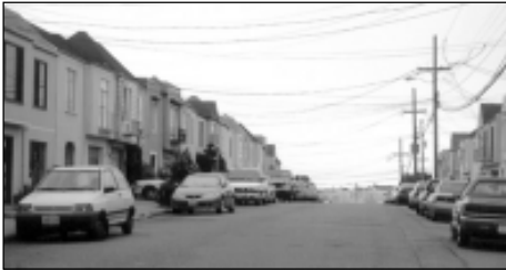
Without trees, residential streets run barren.